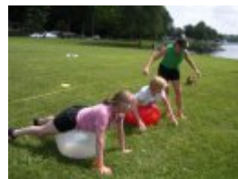
FUN AT THE FLOTILLA

43 North Bailey Road, Thorndale, PA 19372 (behind K Mart on Rt. 30) ~ 610-384-6560